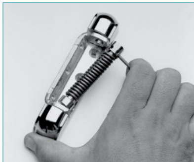
2. Place thrust washer and bushing over hexagon pin on mounted hinge. Insert adjustment pin into adjustment bushing assembly. Grasping adjustment pin, compress spring and place adjustment bushing assembly over round pin.