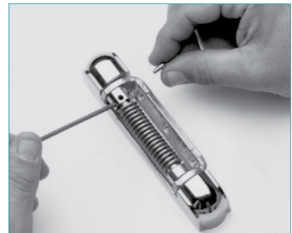
3. Adjust tension; then insert stop pin in hole of adjustment bushing assembly.