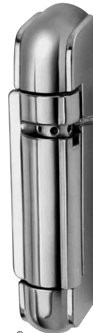
® U.S. Trademark 2,437,925