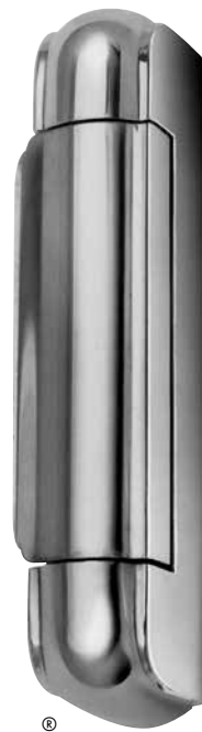
® U.S. Trademark 2,437,925